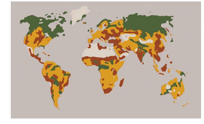
Globally, 52% of agricultural land is already degraded. Brown indicates very degraded areas; gold indicates degraded; green stable; and white no vegetation.